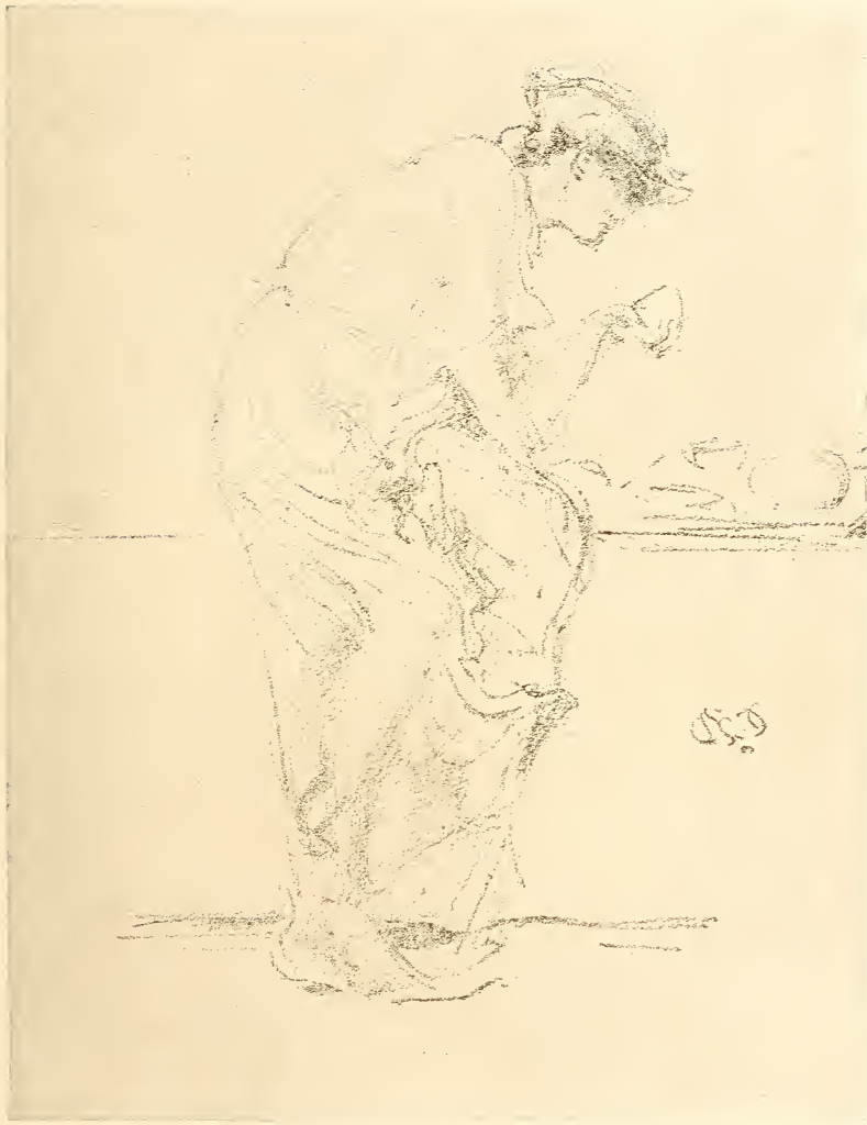
THE HOROSCOPE. (From Lithograph.)